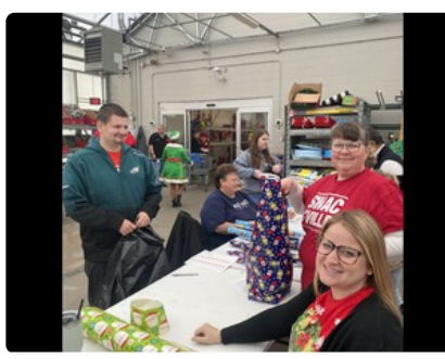
We are here to support the students!